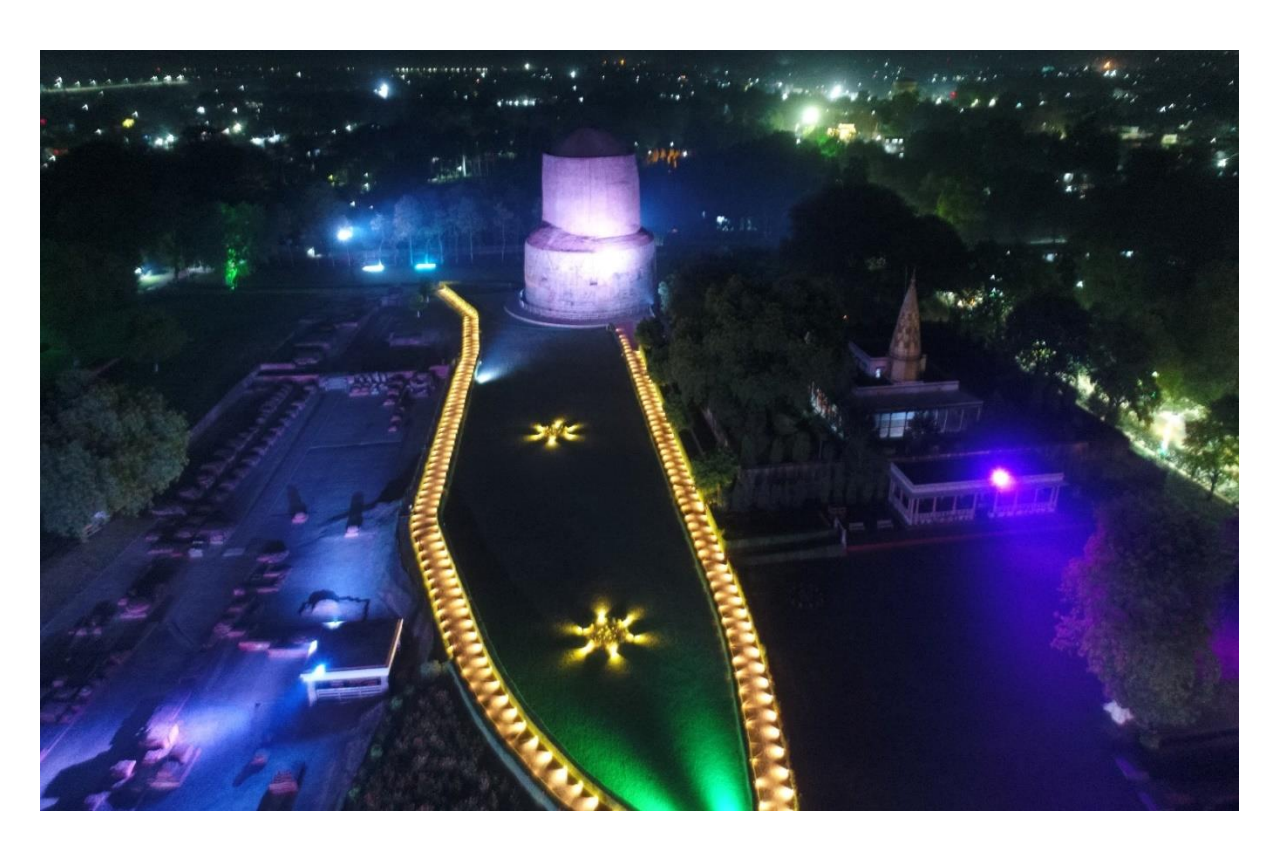
Illumination of Excavated Remains Sarnath