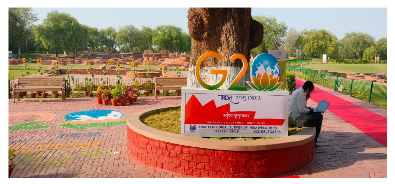
Displayed G-20 logo at Excavated Remains Sarnath