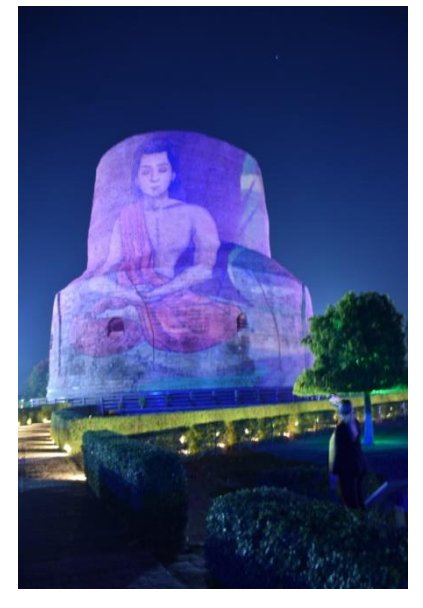
A view of Light and Sound Show