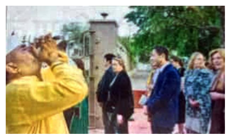
Emitting sound from conch shell by a local vendor to welcome G-20 delegate