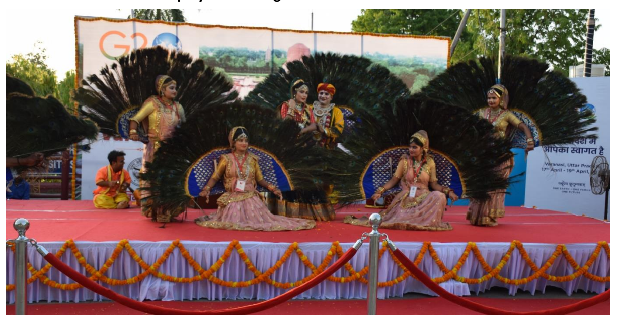
Cultural programmes were also organized to attract and excite to G-20 delegates