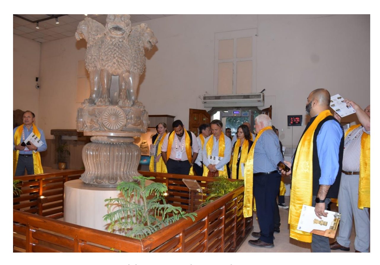
G-20 delegates Visited at Sarnath Museum