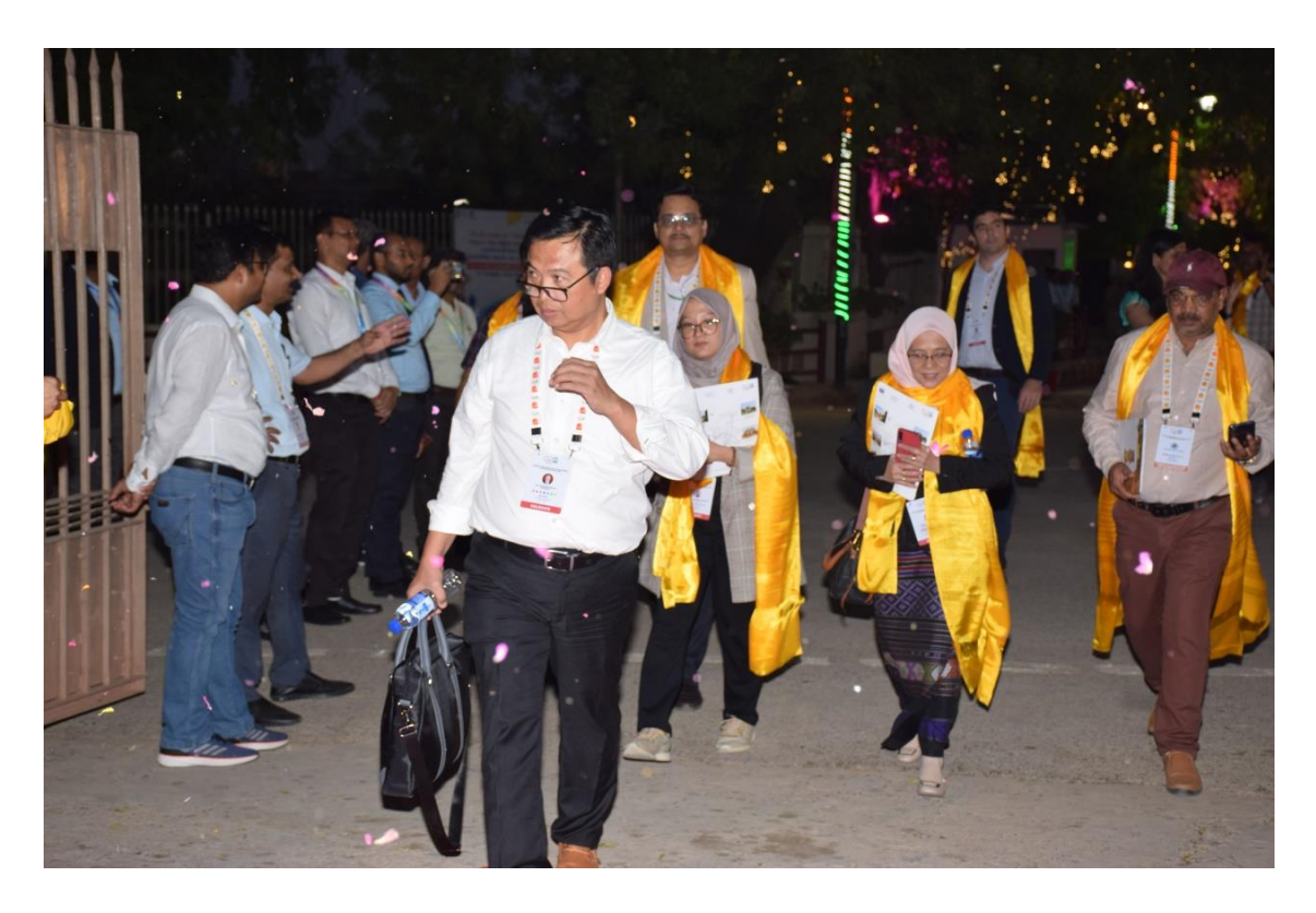
G-20 delegates welcome with shower of rose petal & flowers at the entrance gate