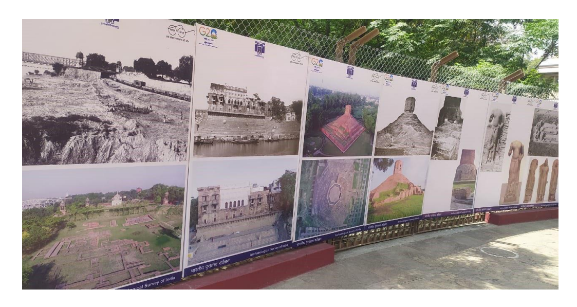
Open air photo-exhibition at Dhamekh Stupa