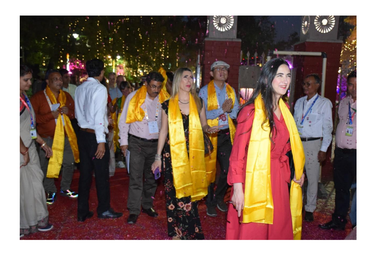
Another view of

G-20 delegates welcome with shower of rose petal & flowers at the entrance gate