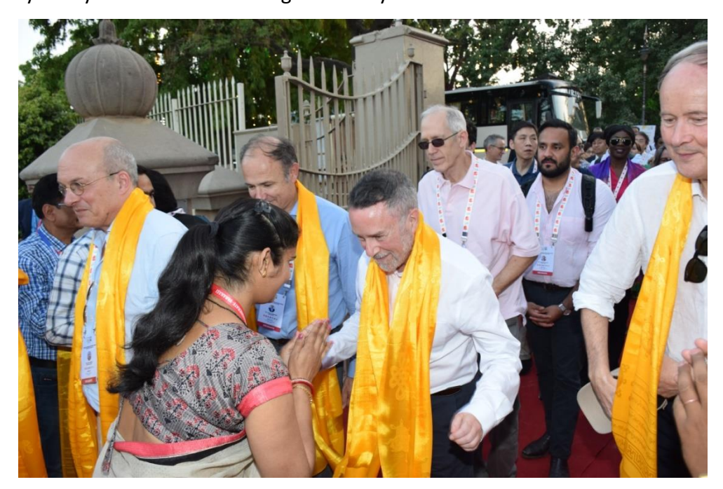
Welcomes G-20 delegates at the main entrance of the Sarnath Museum

Lastly, the delegates watched Light and Sound Show at the Excavated Remains Sarnath Site and knew about the detail life history of Lord of Buddha. The G-20 guests had given many-many thanks to Archaeological Survey of India.