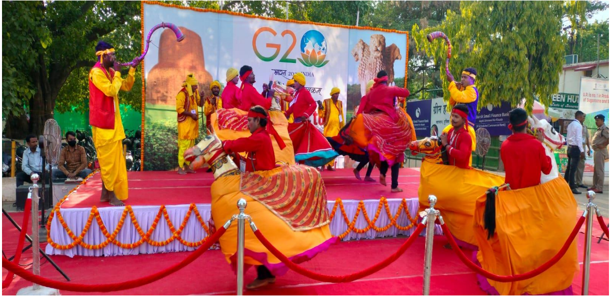
Cultural programmes were also organized to attract and excite to G-20 delegates